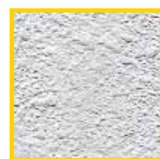
Orange Peel, Fine Splatter

Zip-Tex is ideal for interior, residential refinish, repairs, small new construction, and light commercial jobs, and sprays these common texture finishes: