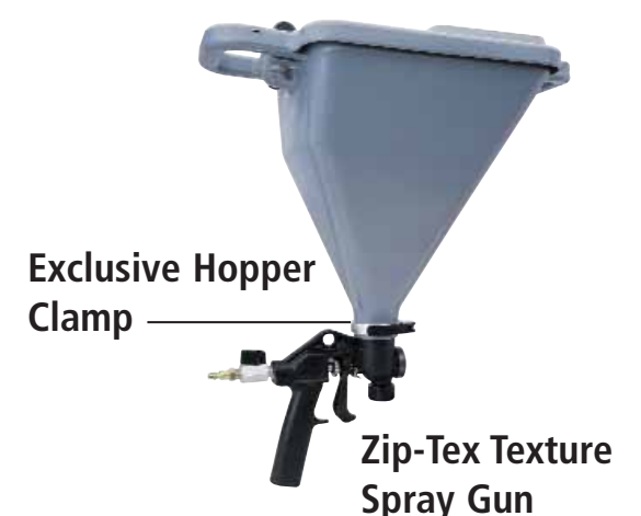
Exclusive Hopper Clamp