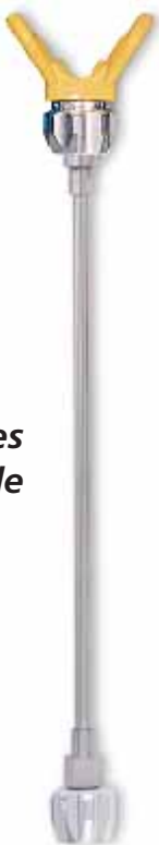
3400 Series Mini Pole

*3500 Series Mini Pole includes AngleHead.