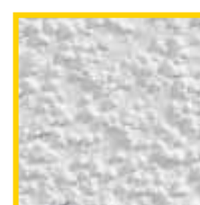
Simulated Acoustics, Popcorn