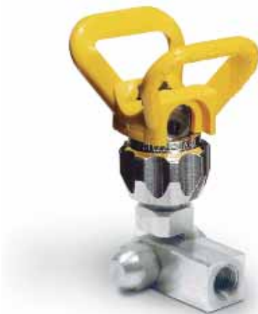
0° to 90° (90° Shown)