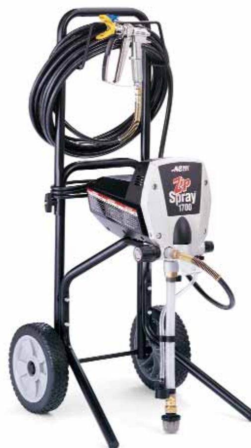
Pump Repair Kit